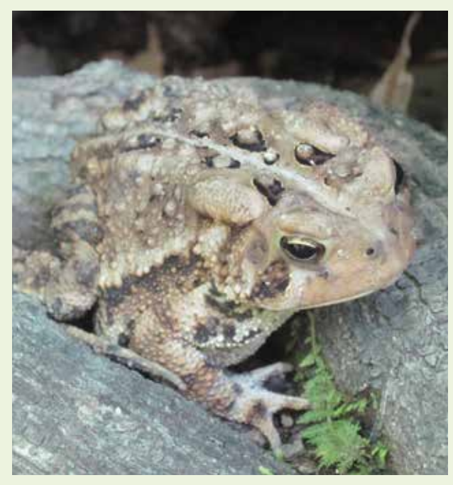
American toad (Anaxyrus americanus) in Lilley Cornett Woods in Kentucky, the location of an old-growth forest research site.